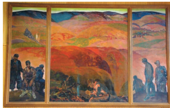
This is a mural celebrating coal in the Necho Allen Hotel in Pottsville.