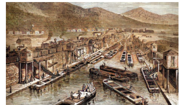
This image shows the coal transportation depot on the Schuylkill Canal in Port Carbon.