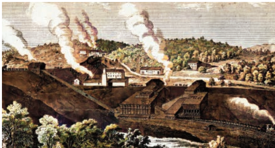
This is a rendering of the coal mine at the Pine Forest Colliery.