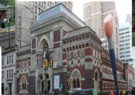
Philadelphia Academy of Fine Arts