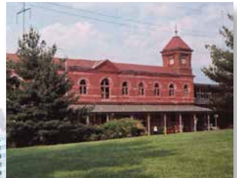
Wilmington Train Station

THE SCHUYLKILL RIVER HERITAGE CENTER AT PHOENIXVILLE