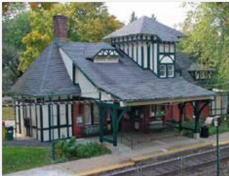
Mount Airy Train Station

Free admission for SRHC Members - No registration is required. $5.00 for Non-Members