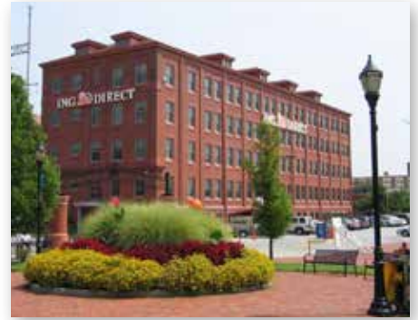
The Pennsylvania Office Building