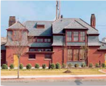
B&O Water Street Station