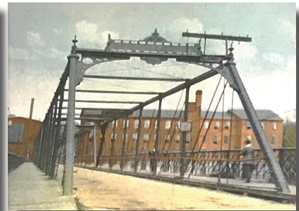
Historic postcard of the Spring City-Royersford Bridge featuring Phoenix columns