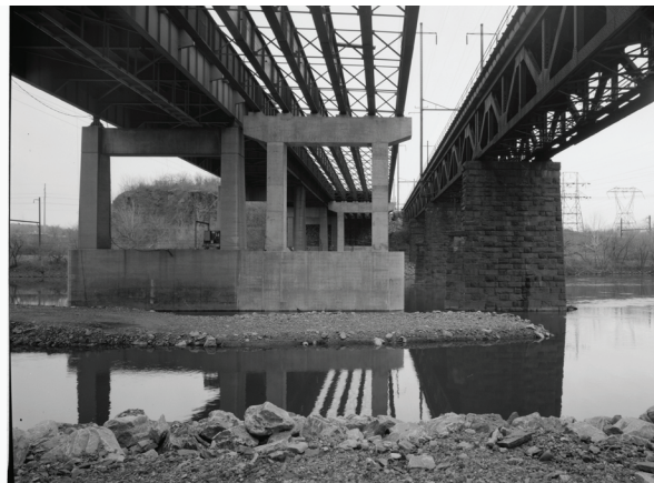
Pennsylvania Railroad, Trenton Cut-Off Bridge