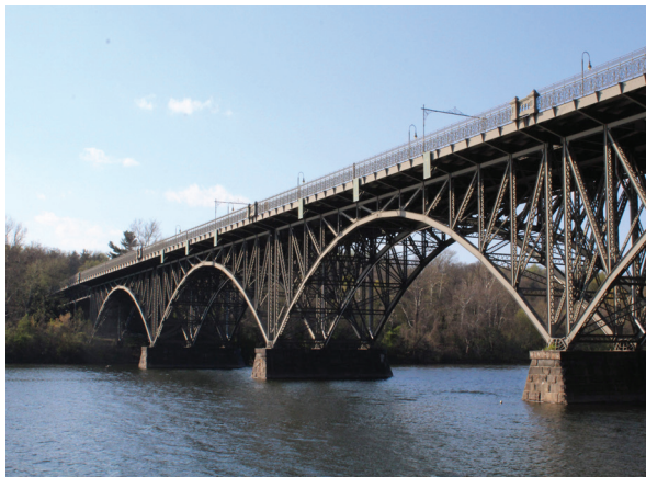
Strawberry Mansion Bridge in Philadelphia

Admission is free for SRHC Members $5.00 for Non-Members. No Registration is required.