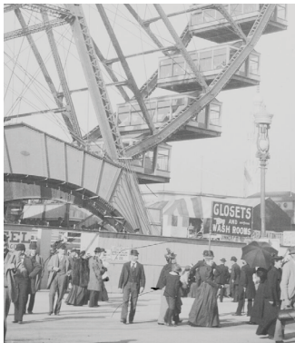
Mr Ferris's wheel at the Columbian Exposition, 1893.